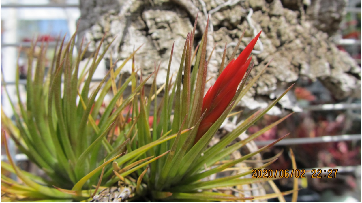
Tillandsia caulescens submitted by Bryan Chan