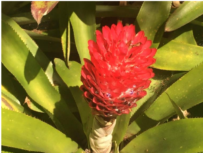
Quesnelia testudo Turtle Head Bromeliad

Placement under trees will also trap a measure of heat that may help Vireyas survive a frost since they are cold sensitive.