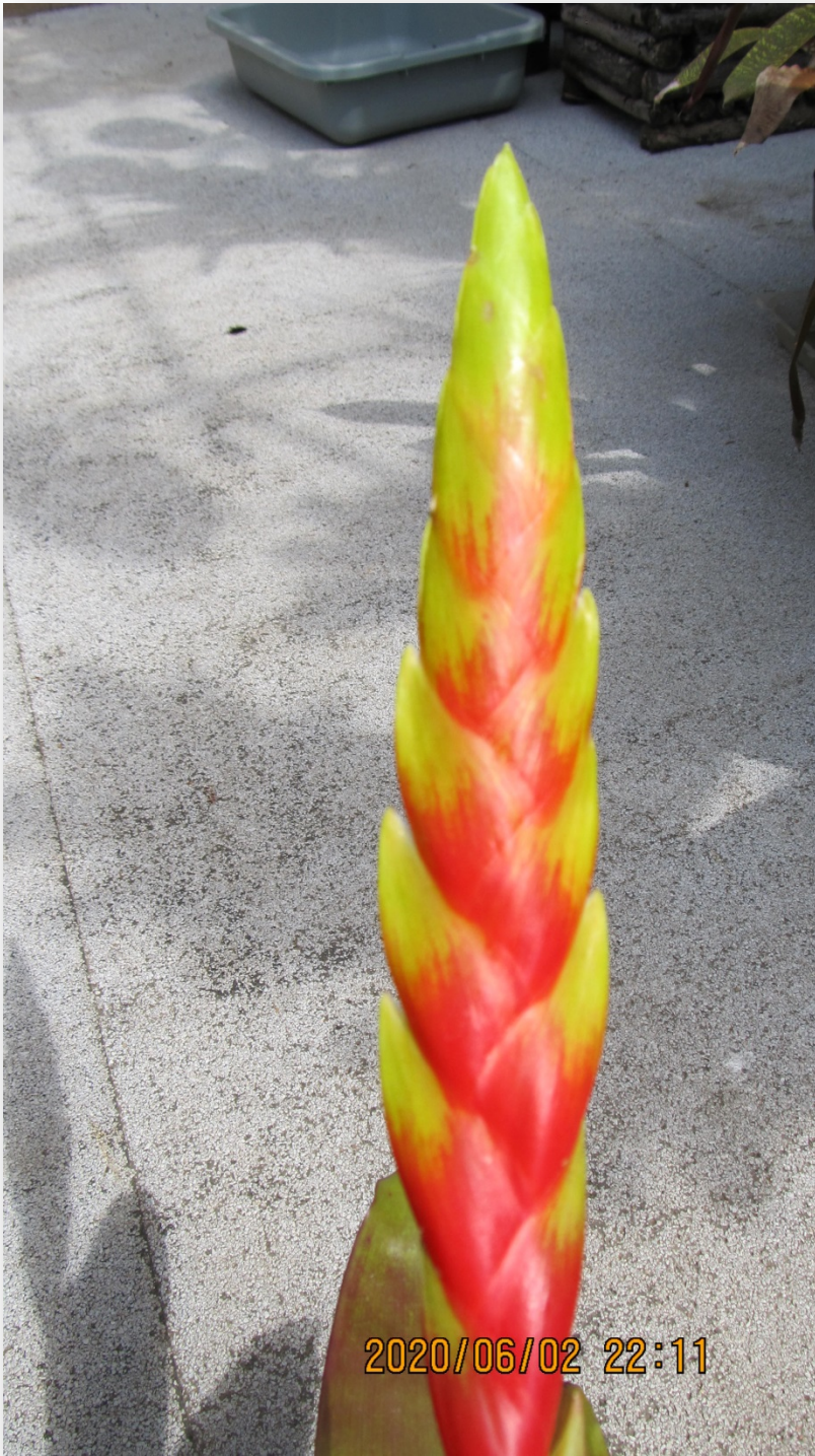
Vriesia hybrid ( Midnight x Inflata )